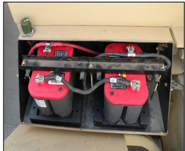
Optima Red Top 34 with 6T Adapter Plate shown Battery NSN 6140-01-378-8232 6T Adapter Plate NSN 6160-01-453-0858