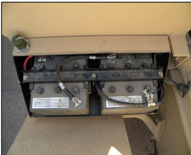
6TL Flooded Lead Acid Battery shown NSN 6140-01-446-9506

6K or 10K model: Here's another example of where you can substitute Optima AGM batteries for the flooded 6T batteries or the more expensive 6TAGM batteries. These pictures are from a VRRTFL with old 6T batteries and then with model 34 Red Top Optimas.